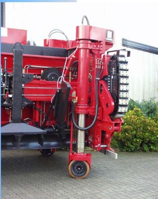
Fold-out caterpillar drive