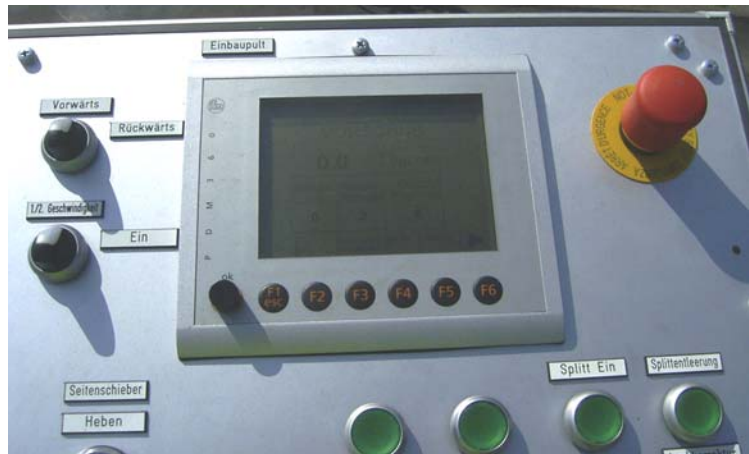
Grit spreading, computer-controlled