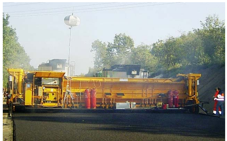
Gussasphalt (mastic asphalt) - finisher with Powermoon-site lighting