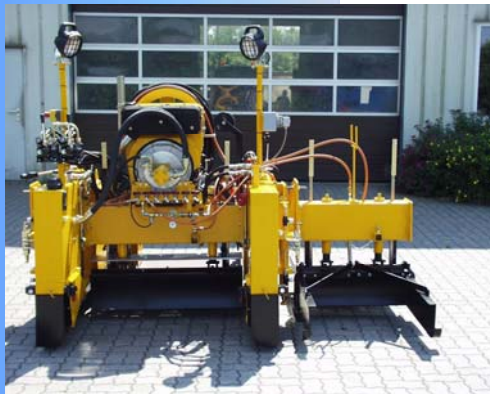
finisher GAB 25 with side-strip finisher and further options