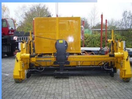
finisher GAB 75 TST with preparation for levelling equipment and further options