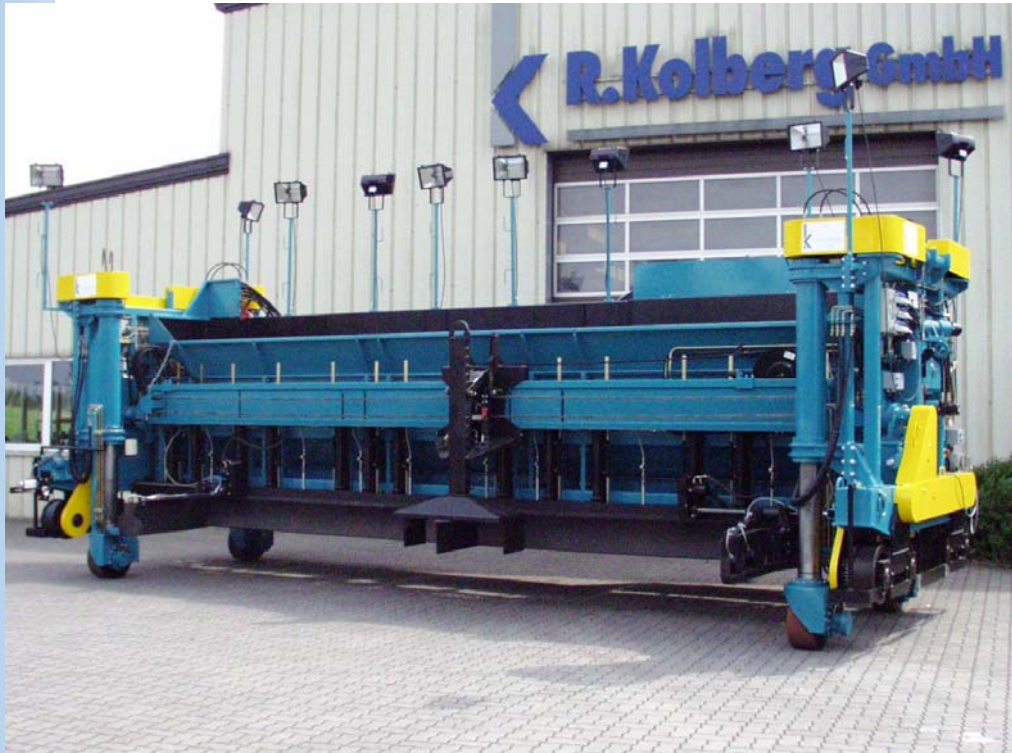
Gussasphalt (mastic asphalt) – finisher KBR 75 on extended hydraulic pillar ready to load on low platform trailer

And here are some more fotos of further options: