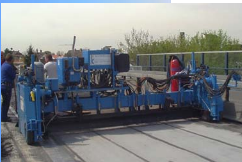
finisher GAB 50 M